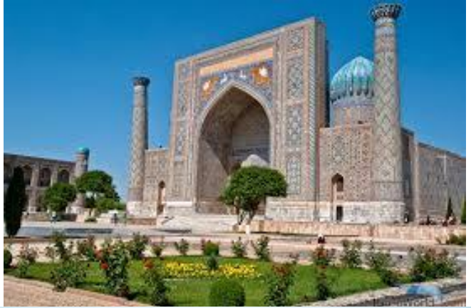
Stop At: Tillya Kori Madrasah Was built in 1660, and it is the final building in the Registan architectural Ensemble